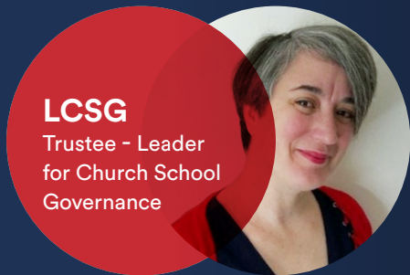
LCSG Trustee - Leader for Church School Governance